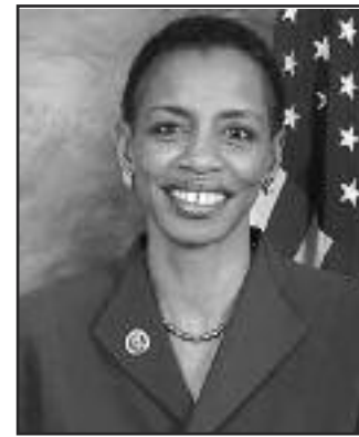
Congresswoman Donna F. Edwards