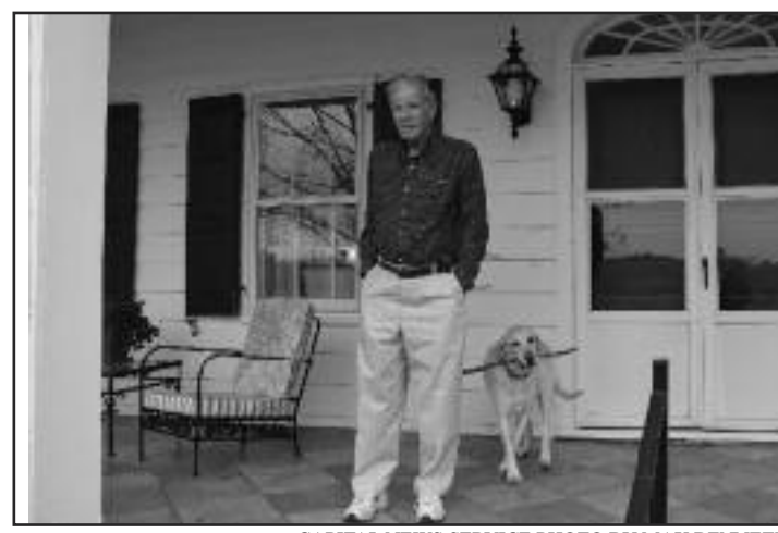
Gov. Harry Hughes and his Labrador retriever, Miller, look out on the Choptank River. Miller loves to play fetch with his sticks.

"I remember telling people it's not going to happen