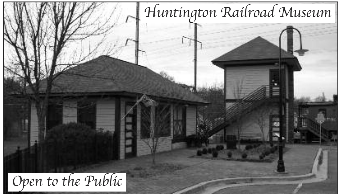
Huntington Railroad Museum

"Hurricane Sandy showed us the importance of keeping our hospitals operating at their best, even during the worst of emergencies," said Senator Ben Cardin. "This FEMA grant will keep the University of Maryland Charles Regional Medical Center online during a power outage, and provide confidence for Marylanders in and around Charles County that public health and safety will not be compromised during such a crisis."