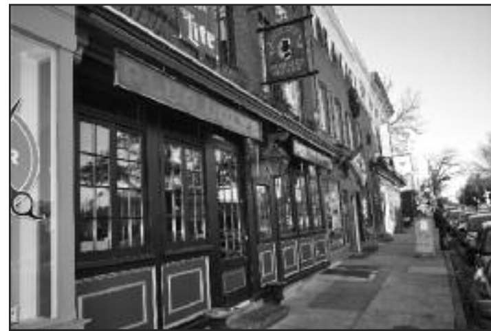
Row of bars and shops on O'Donnell Street in Canton Square, Baltimore.

Business people who want to open a restaurant in three parts of the district: the Canton industrial area, downtown and Harbor East must pay even more. In those three areas of the 46th District, restaurateurs can seat more than 150 people and serve alcohol, but they