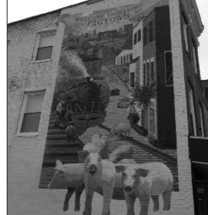
A mural in Pigtown, officially known as Washington Village.