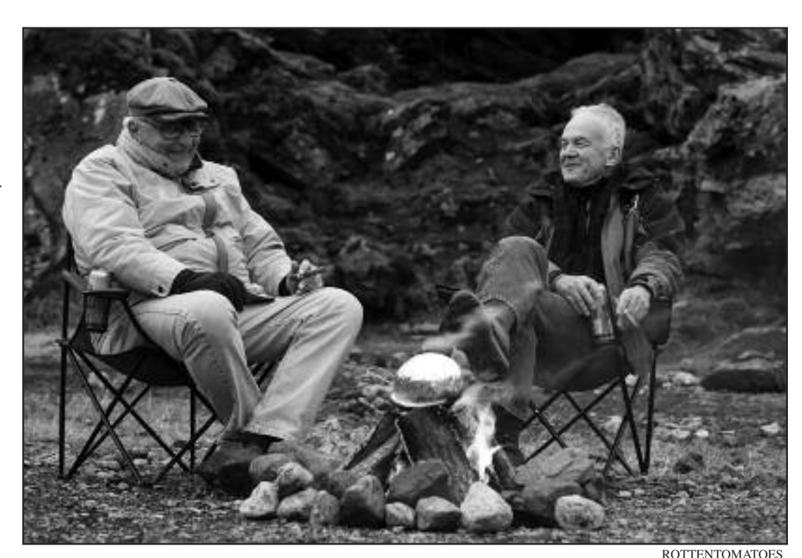
A pair of 60-something ex-brothers-in-law sets off on a road trip through Iceland, hoping to reclaim their youth. Their picaresque adventures, from trendy Reykjavík to rugged outback, are a throwback to classic bawdy road comedies as well as a candid exploration of aging, loneliness, and friendship.

And now you've had basically the entire plot spoiled for you. Mitch and Colin fly to Reykjavik first, spend some time there, then drive an SUV across the country's rugged, gorgeous terrain to visit geysers and hot springs and other scenes of nat-