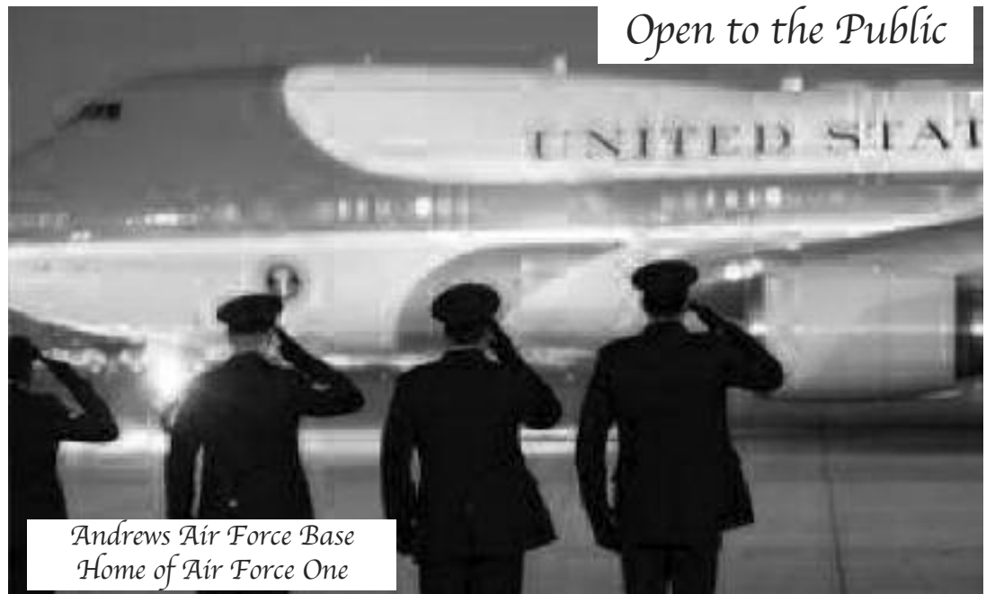
Andrews Air Force Base Home of Air Force One

From the National Urban League family to yours - we wish you a blessed holiday and a Happy New Year. In the words of Oprah Winfrey, "Cheers to a New Year and another chance for us to get it right."