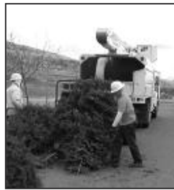
Prince George's County Department of Environmental Resources' (DER) Waste Management Division grind Christmas trees into mulch.

LARGO, MD — The Prince George's County Department of Public Works and Transportation (DPW&T) announced changes to TheBus schedule for Routes 21, 21X, 51, 51 Extended and 52 that will take effect on January 6, 2014.