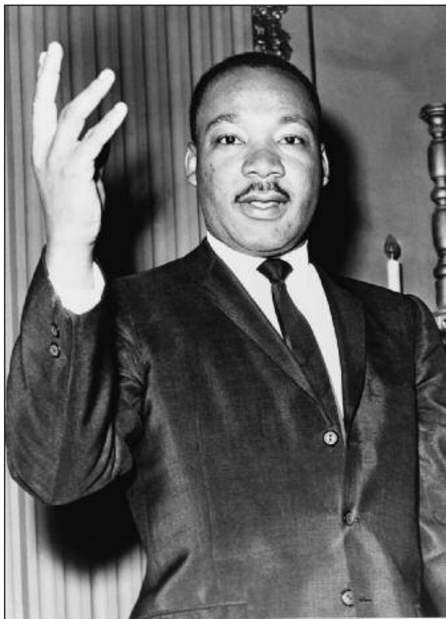
Martin Luther King, Jr. (January 15, 1929 – April 4, 1968) was an American clergyman, activist, humanitarian, and leader in the African-American Civil Rights Movement. He is best known for his role in the advancement of civil rights using nonviolent civil disobedience. King has become a national icon in the history of American progressivism.