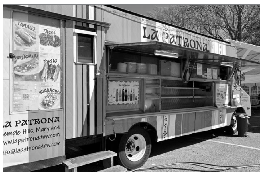
La Patrona food truck in Temple Hills, Md. in April 2026. Soon a La Patrona restaurant will open nearby, thanks to Maryland Business Boost.