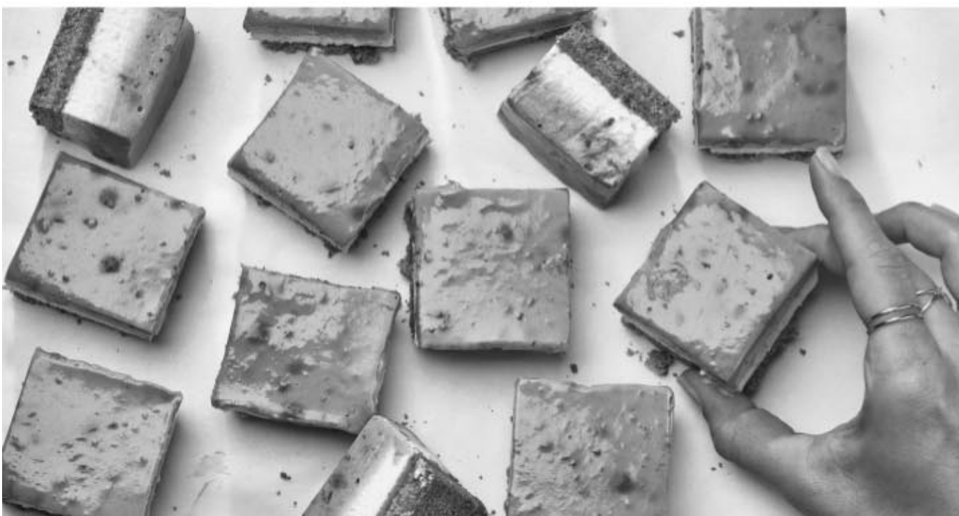
No Bake Dragon Fruit Cheesecake Bars