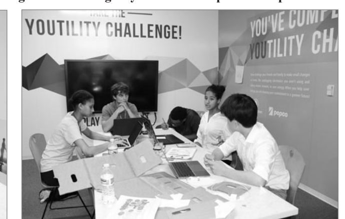
Hands-on innovation: Students collaborate and construct their prototype using cardboard scraps during Day 3 of the Entrepreneurship Summit.