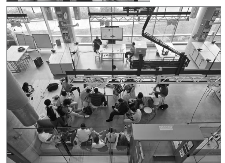
Engaged and inspired: Students listen intently to a UMD engineering student during Day 2 of the Entrepreneurship Summit.