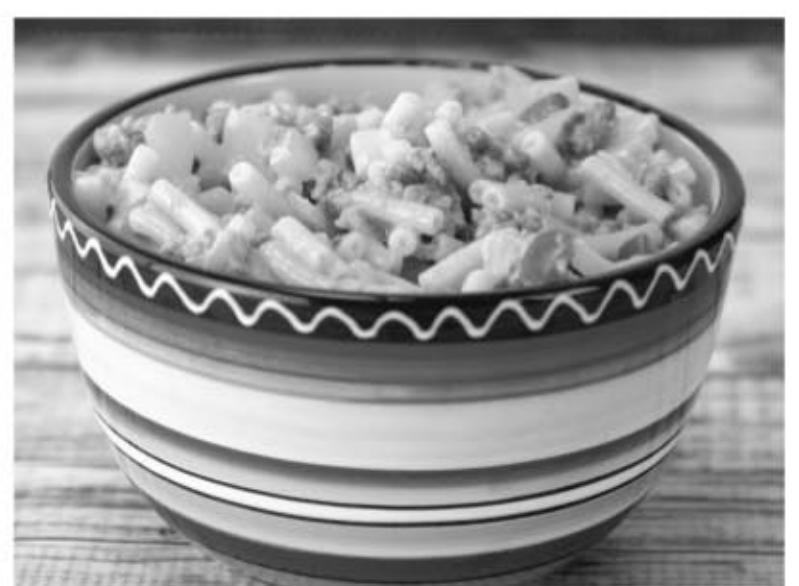
Taco Mac and Cheese

On plates, top crushed tortilla chips with meat sauce, lettuce, cheese and sour cream, as desired.