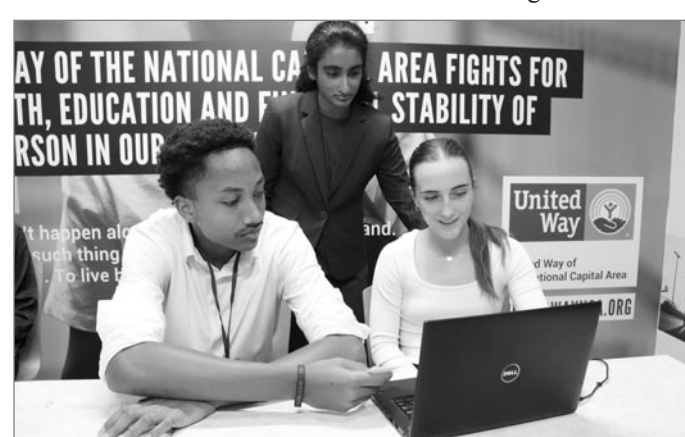
Collaborative minds at work: Students immerse themselves in building their business on Day 4 of the Entrepreneurship Summit.