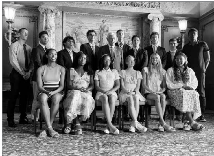
Some of the Fifth District students who were appointed to the United States Service Academies pose with Congressman Steny Hoyer.