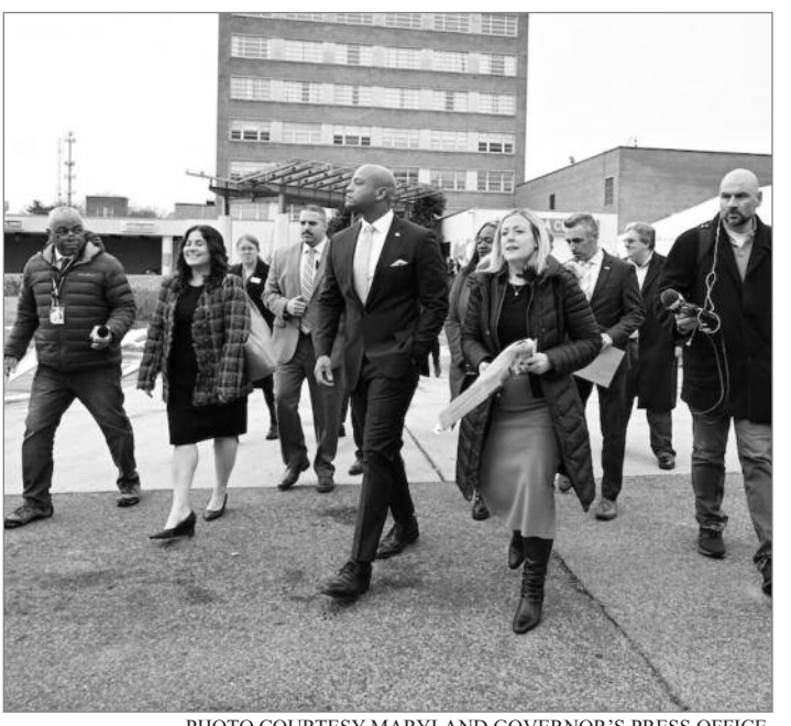
On January 23, Governor Wes Moore visited a redevelopment project in Cheverly and toured the Maryland Department of Housing and Community Development headquarters in Lanham.