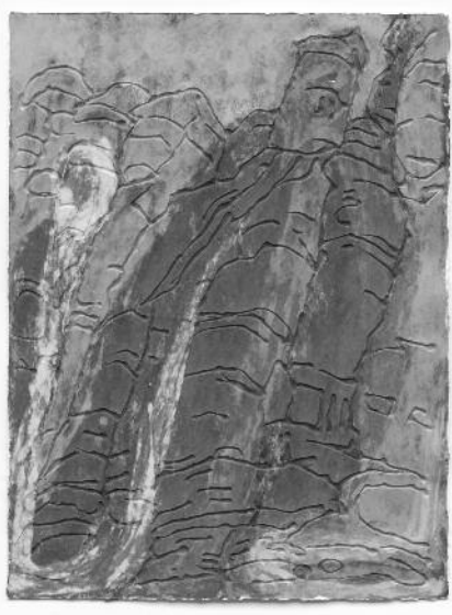
Image: Montserrat Silver 4. Pigmented flax pulp painting, 32 x 24 in.

scale pieces made in Catalonia from Sures' different vantage points at the foot of the mountain. After those were complete, she traversed the mountain range further by car and foot, leading to an additional 20 smaller embossed pulp paintings. "I was able to carry the mountain out of Catalonia with me."