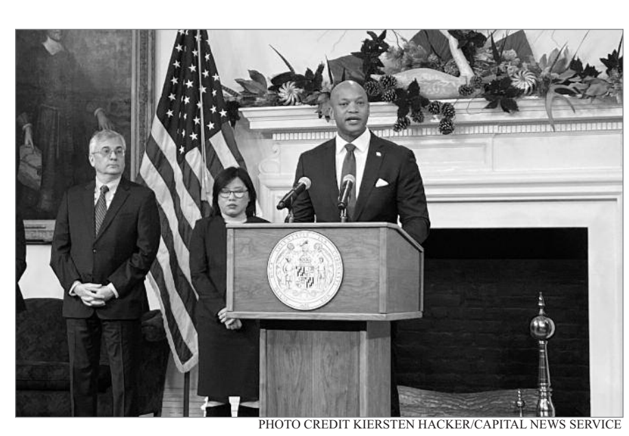
Gov. Wes Moore announced his 2024 public safety legislative priorities at an Annapolis press conference on Jan. 9, 2024.

While Moore acknowledged the coming debate over juvenile crime this session, he also stressed the importance of supporting communities and the advocates working at the grassroots level to