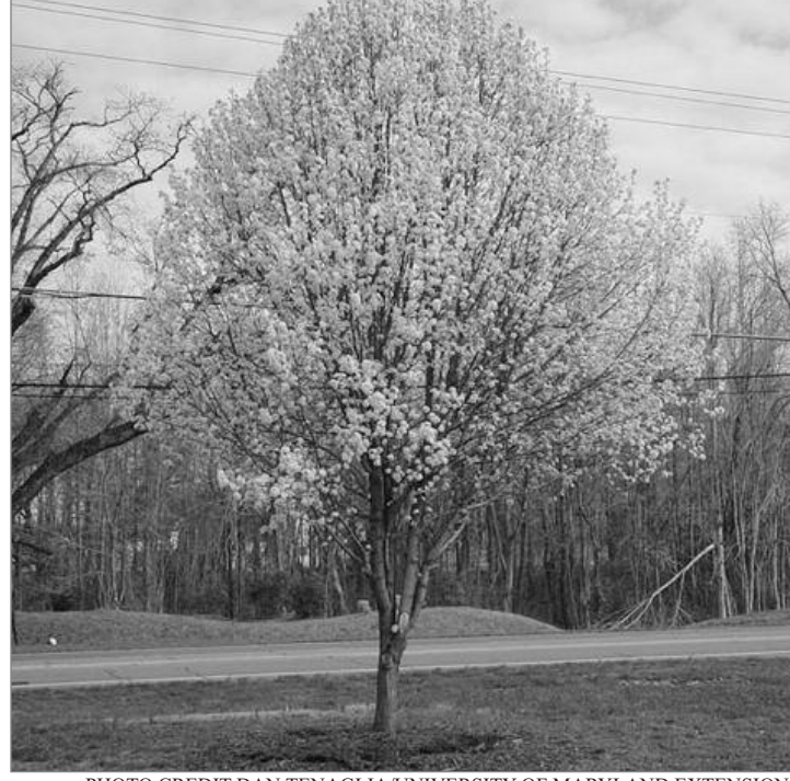
Callery Pear

The Extension sees a lot of this species in Western Maryland, invading agricultural areas. "The Maryland Department of Agriculture has named this a Tier 2 invasive plant. This classification means retail stores that offer this plant for sale must display a required sign indicating that it is an invasive plant," according to the Extension website.