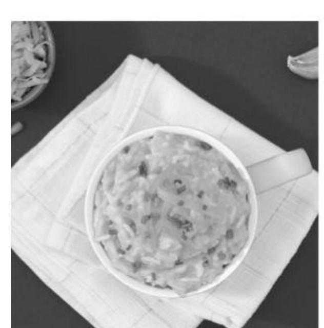
"Mac" and Cheese in a Cup

To find more quick yet satisfying and delicious dinner ideas for busy school nights, visit MinuteRice.com.