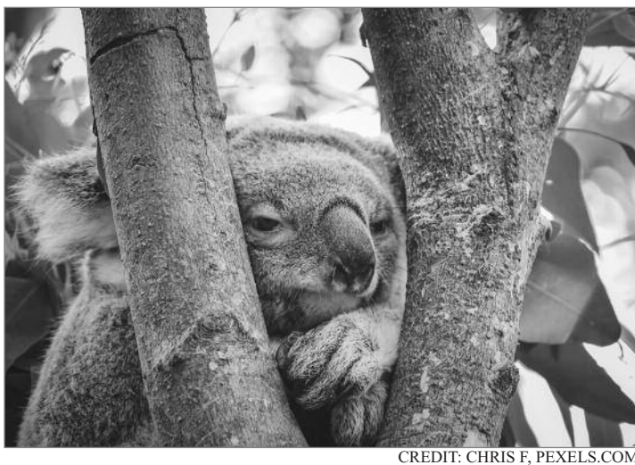
Koalas are on the ropes across Australia thanks to last year's

CONTACTS: "Australia lists koala as an endangered most https://yaleclimateconnections.org/2022/06/australia-lists-koalaas-an-endangered-species-across-most-of-its-range/; "New South