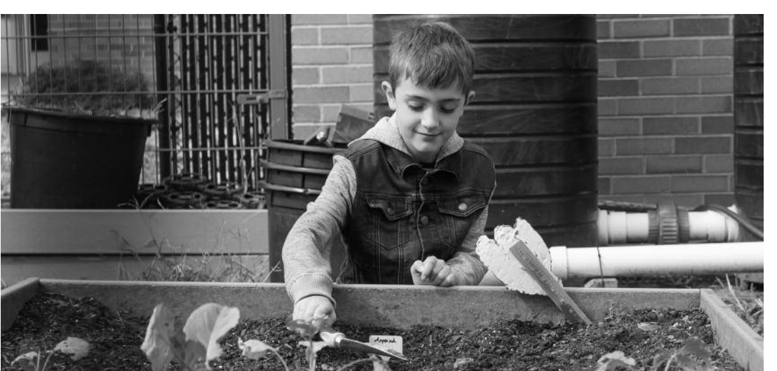
A still image from Never Too Small.