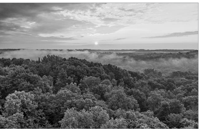
The worst years on record for primary tropical forest loss across the Amazon and beyond were 2016, 2017 and 2019.

While deforestation is an issue everywhere, it is particularly problematic in the tropics where the majority of the world's biodiversity lives. Another leading conservation group, WWF, points out that some 17 percent of the forest across the Amazon has been cut down over the last 50 years, mostly to make room for cattle ranching—so we can enjoy our steaks and burgers. The group warns that