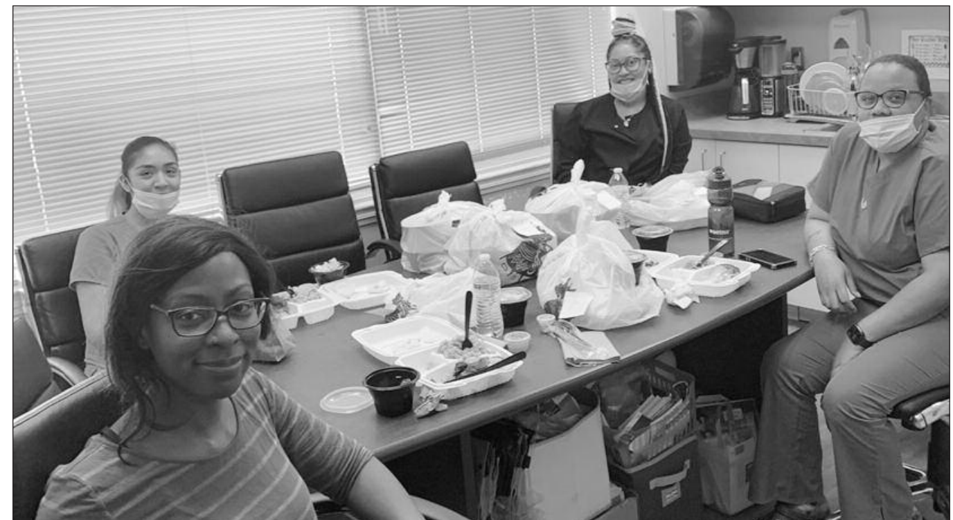
For National Nurses Week, as part of its "Food for First Responders" mission Amerigroup MD bought lunches for medical staff and nurses as various locations throughout Maryland including a special lunch for the Children First, LLC Largo where staff and nurse practitioners specialize in medical care for children.