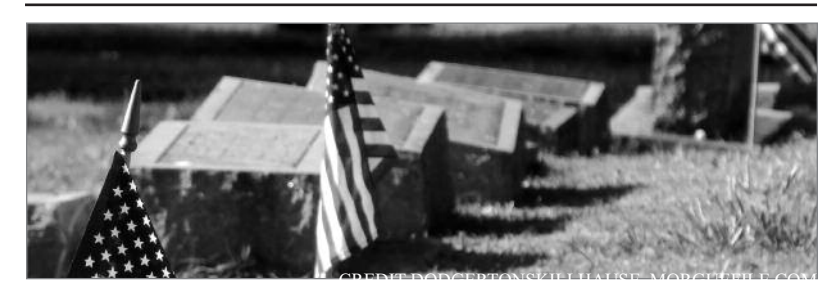
From The American Legion, National Headquarters

Vie Management is a vertically integrated real estate investment and management company operating a diversified portfolio of student housing and multifamily communities throughout the country. With over 18 years of experience, Vie has owned and managed more than 40,000 beds. Vie Management is active in all its local communities, via its Vie Inspired Program, and committed to philanthropic investment wherever we are located. www.viemgmt.com