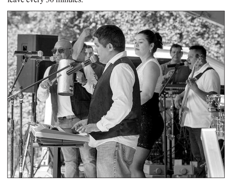
Above and below, attendees enjoy the activities, sights, and sounds of the 2017 Hispanic Festival. Enjoy rides and games, music and dance, pony rides, and more at the 37th Annual Hispanic Festival on September 15.

Patrons can enjoy FREE shuttle rides from Langley Park-Mc-Cormick Elementary School in Langley Park and Rosa Parks Elementary School in Hyattsville. Shuttle rides begin at 11:30 am and leave every 30 minutes.