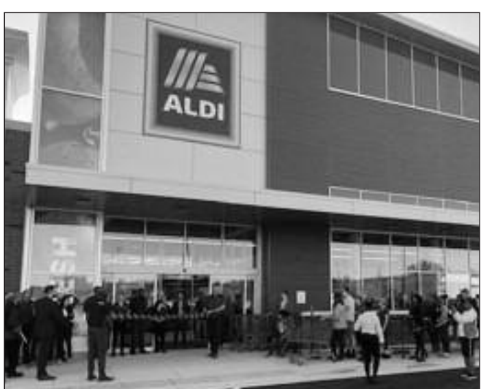
The ribbon-cutting ceremony held on Thursday, August 29 at ALDI's new Clinton store.

The new Clinton ALDI store layout features expansive refrigeration space to accommodate the fresh, healthy and convenient products people want most. ALDI recently expanded its product offerings, making 20% of its total selection new. This expansion is part of the company's aggressive national growth and remodel plan, and it includes a 40% increase in its fresh food selection, with many organic, convenient and easy-to-prepare options. ALDI stores also feature open ceilings, natural lighting and environmentally friendly building materials. The Clinton store will be open daily from 8 a.m. to 9 p.m.