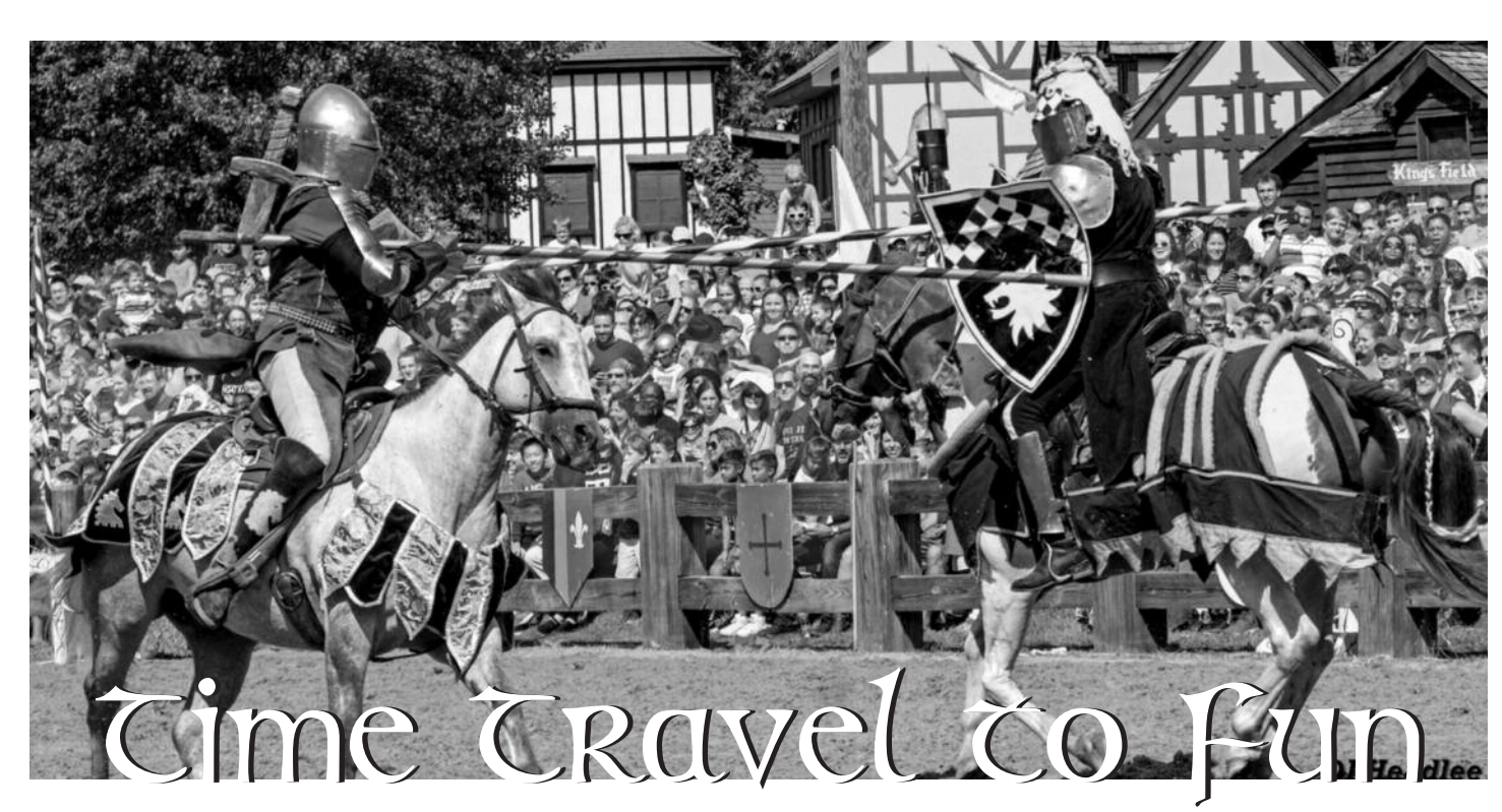
The 2018 Maryland Renaissance Festival Opens This Weekend

By PRESS OFFICE Maryland Renaissance Festival