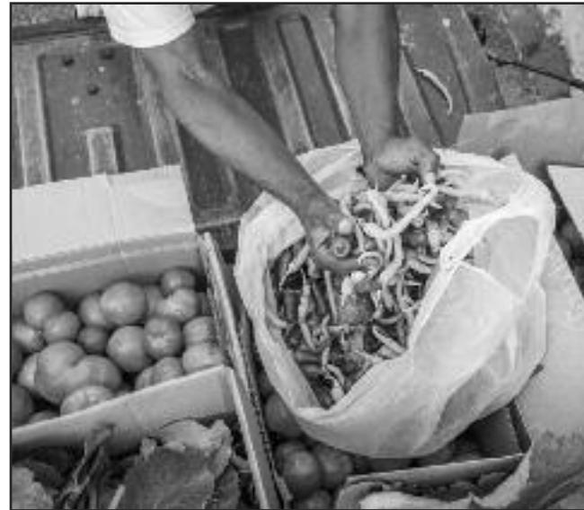
On the way to the food pantry in West Philadelphia.

With the "Garden to Give," program, everyone who participates is a winner. The real prize is making a difference while doing something you love. Once you've experienced the benefits of sharing fresh produce with the hungry in your community, you are likely to find yourself making regular donations of garden fresh fruits and veggies to those in need ... and feeling great about it, too.