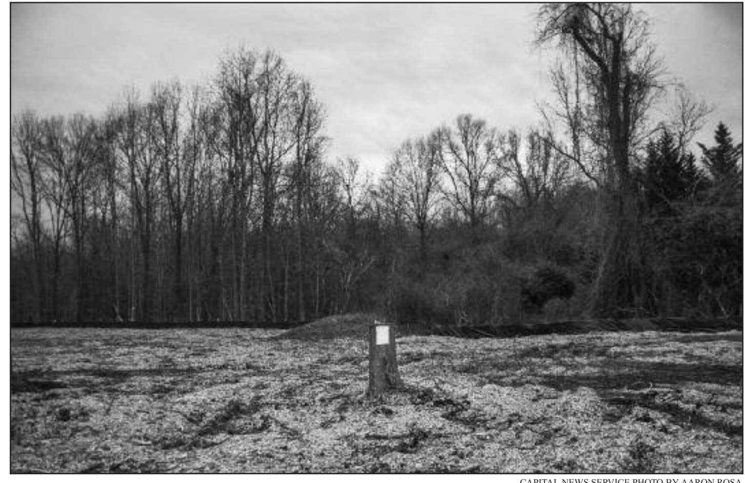
A permit displayed on a tree trunk at a development site in Edgewater, Md., Feb. 22, 2018. Last week, House and Senate committees addressed cross-filed bills that would amend Maryland's Forest Conservation Act. The bills would tighten replanting requirements for developers that clear forests.