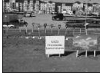
Ready for the Groundbreaking Ceremony to begin.

The decision to choose Prince George's County as its next