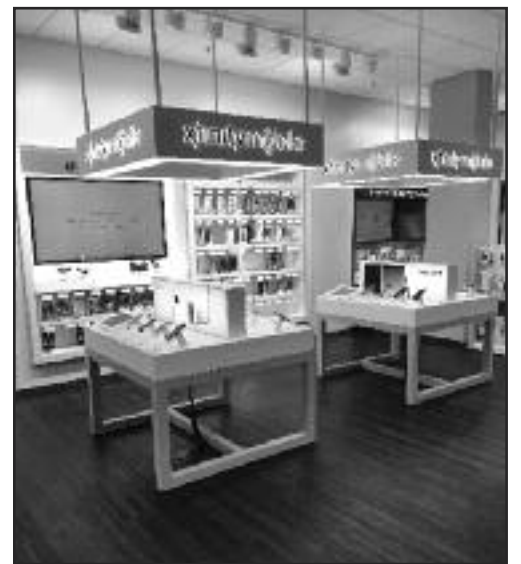
Information about Xfinity Mobile and a display of the latest devices.