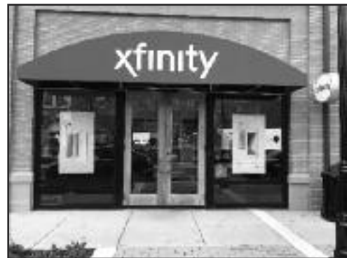
Exterior of new Xfinity Store located at 4555 Van Buren Street, Riverdale Park, MD.

The Xfinity Store is open Monday through Saturday from 9 a.m.–9 p.m. and Sunday from 10 a.m.–6 p.m.