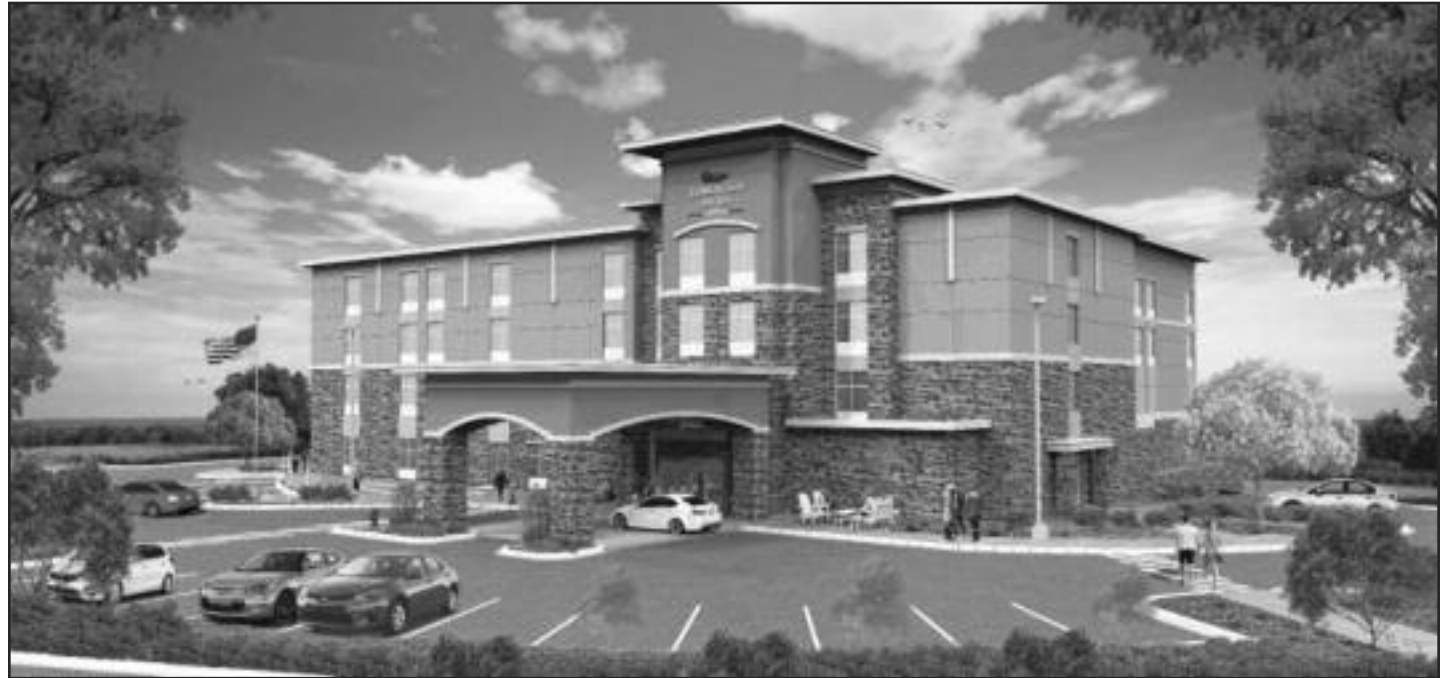
Artist rendering of the soon-to-be, Homewood Suites, by Hilton in Largo, Maryland.