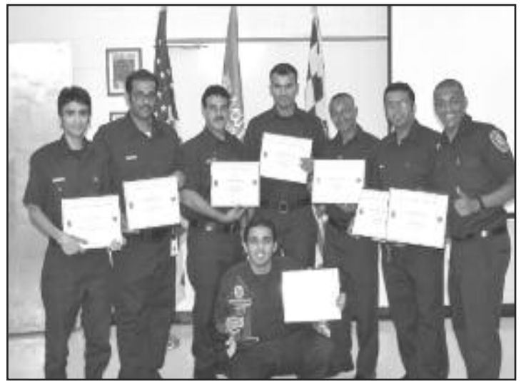
Eight Saudi Arabia Aramco Firefighters display their Certificates after 3 weeks of orientation at the PGFD Fire/EMS Training Academy.