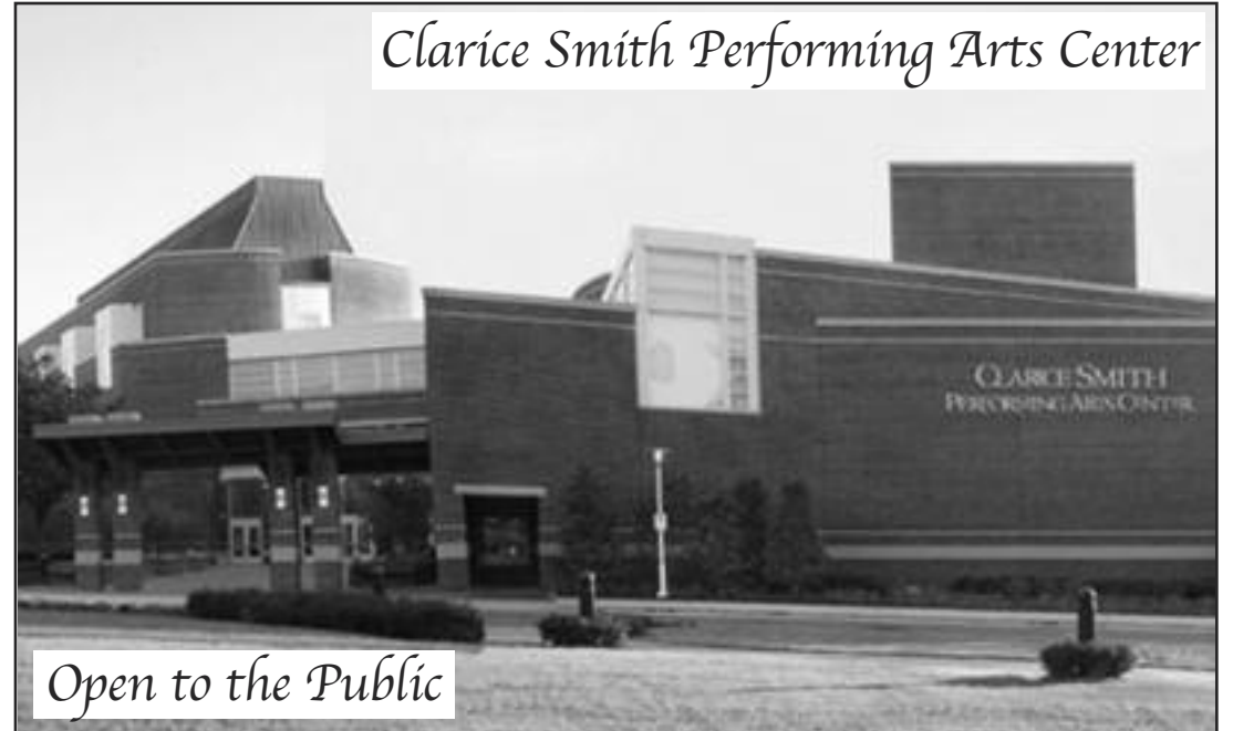
Clarice Smith Performing Arts Center