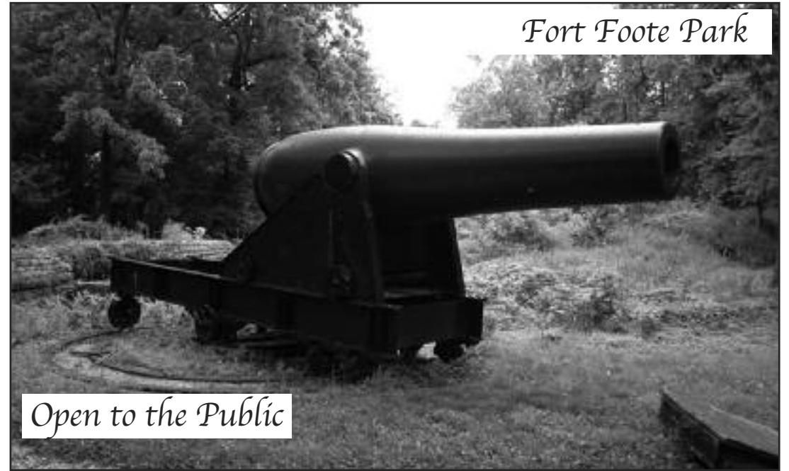
Fort Foote Park

"While improvements are needed to bring health care costs down for everyone, the Affordable Care Act has brought access to affordable coverage for thousands of Marylanders, and the law must not be repealed. Should the Affordable Care Act be repealed or sabotaged, thousands of families in Maryland and across the country will be irreparably harmed. I will continue to fight efforts that would take health care away from Marylanders and raise costs for many more."