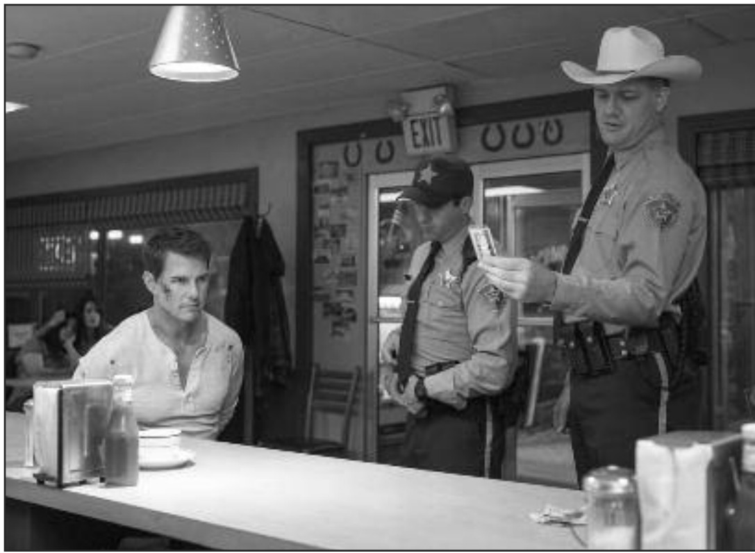
Tom Cruise returns as Jack Reacher in this sequel based on Lee Child's bestselling novel Never Go Back , which finds the itinerant problem-solver accused of murder, and learning that he may have a child he has never met.