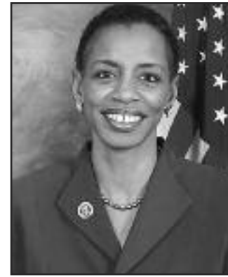
Congresswoman Donna F. Edwards