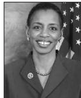
Congresswoman Donna F. Edwards