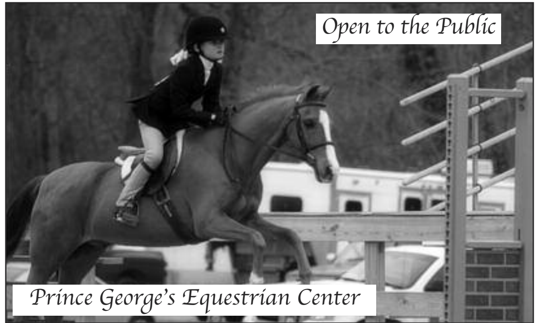
Open to the Public

“The light is he, shining on you and me,” White’s brothers wrote. His work was infused with light—“shining bright to see what you can truly be” in “Shining Star,” or “chasin’ the clouds away” in “September.” Illuminating, life-giving,