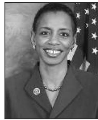
Congresswoman Donna F. Edwards

"Just six days into the New Year, Republicans picked right up where they left off in 2015 with this damaging Reconciliation bill. This irresponsible legislation would cause over 22 million hard-working Americans to lose their health care