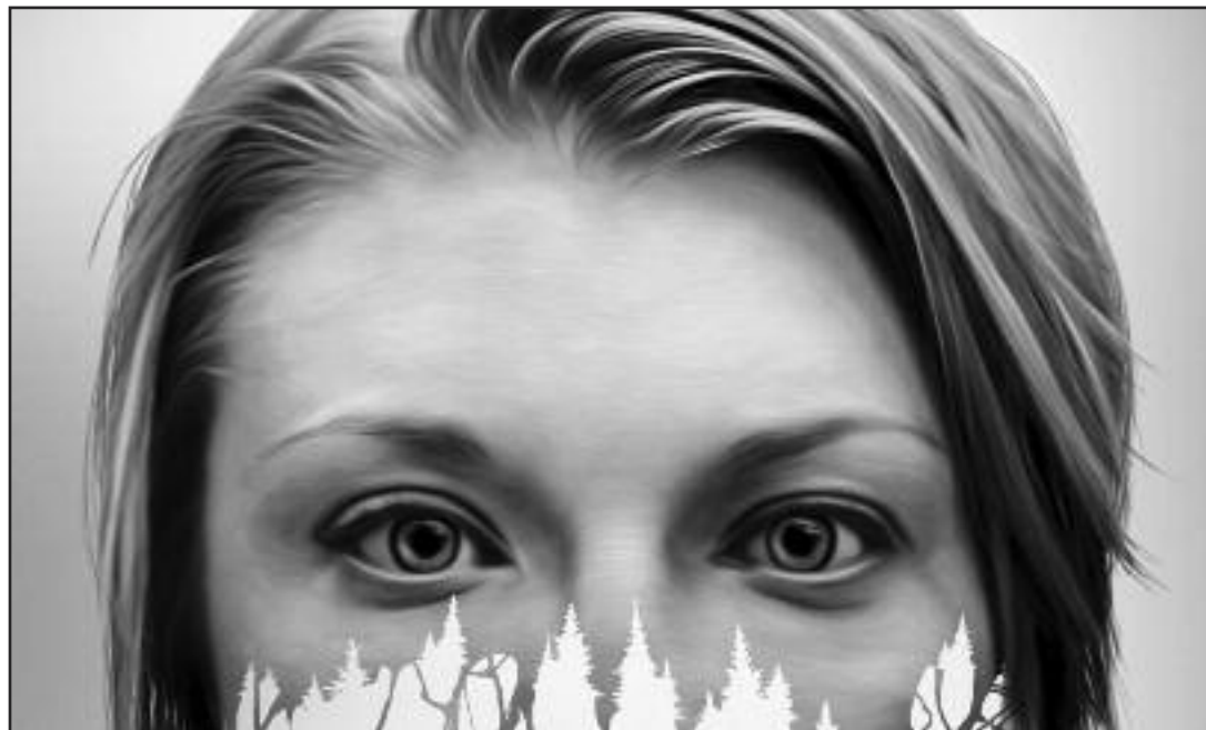
Against the backdrop of Japan's Aokigahara forest, where people go to end their lives, an American woman braves the mysterious, uncharted terrain to search for her missing sister.

Local law enforcement isn't much help. "After 48 hours, we have to assume the person has gone through with their suicide plan," says one cop. Whaddaya gonna do, y'know? The people at the ranger station inform Sara that the forest is full of angry, mischievous spirits, and that it's dangerous to leave the marked path because the ghosts will