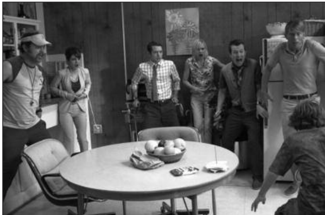
When a cafeteria food virus turns elementary school children into killer zombies, a group of misfit teachers must band together to escape the playground carnage. The film stars Elijah Wood ( The Hobbit, Lord of the Rings), Rainn Wilson ( "The Office"), and Alison Pill ( "The Newsroom") as teachers who fight to survive the mayhem while hilariously bickering in an uncomfortable love triangle on the worst Monday of their lives.

The setting is an elementary school, where a would-be horror novelist named Clint (Elijah