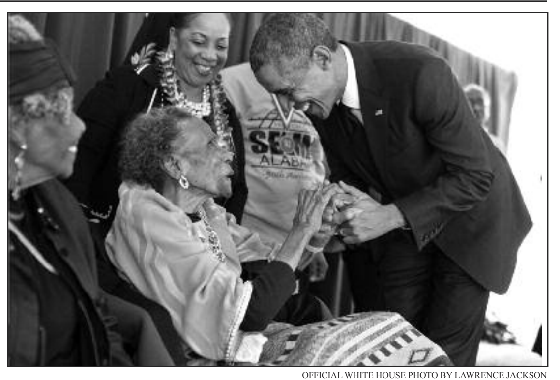
The Obamas and the Bushes continue across the bridge.

These were just two of the dozens of foot soldiers in attendance who had marched that day 50 years ago and helped changed the course of history. Without them, it's unlikely that