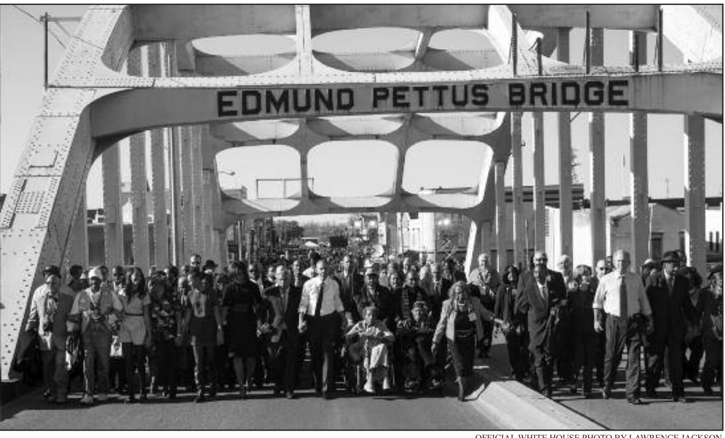
The Obamas and the Bushes continue across the bridge.