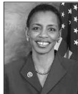
Congresswoman Donna F. Edwards

You can also stay connected with WSSC via the Customer Notification System (CNS), which alerts customers via text and/or email when breaks affect service and daily routines. (Customers must reg-