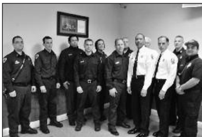
A plaque was presented that included incident details and all the members recognized. This plaque will be on display on the Silver Hill Fire/EMS Station.

Crews arrived to find a young boy whose hand was pinned between a metal kick plate and the rubber grab-rail at the bottom of the escalator. It soon became apparent that crews were facing two challenges: the victim's position and dismantling the escalator, which was necessary to ascertain the true depth of entrapment. Due to the age and poor condition of the device, a more unconventional technique was required to free his hand. Several attempts were made to lubricate the boy's hand and gently slide it out; however, his response of intense pain made this the least favorable option. After considerable cutting and prying, it was determined that slicing through the rubber grab rail and employing a jack to lift and remove the drive wheel was the best alternative. Taking extreme precaution to avoid further harming the child, chains were used to