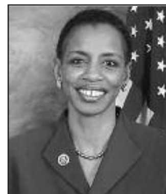
Congresswoman Donna F. Edwards