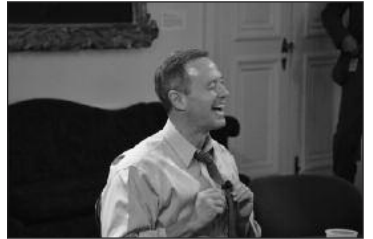
Gov. Martin O'Malley laughs as he prepares to address the media at the Governor's Reception Room at the Maryland State House in Annapolis, Maryland, January 16, 2015.

"The problem we need to solve is how to make the economy work for all of us again," he said, pointing to Maryland as the state with the highest median