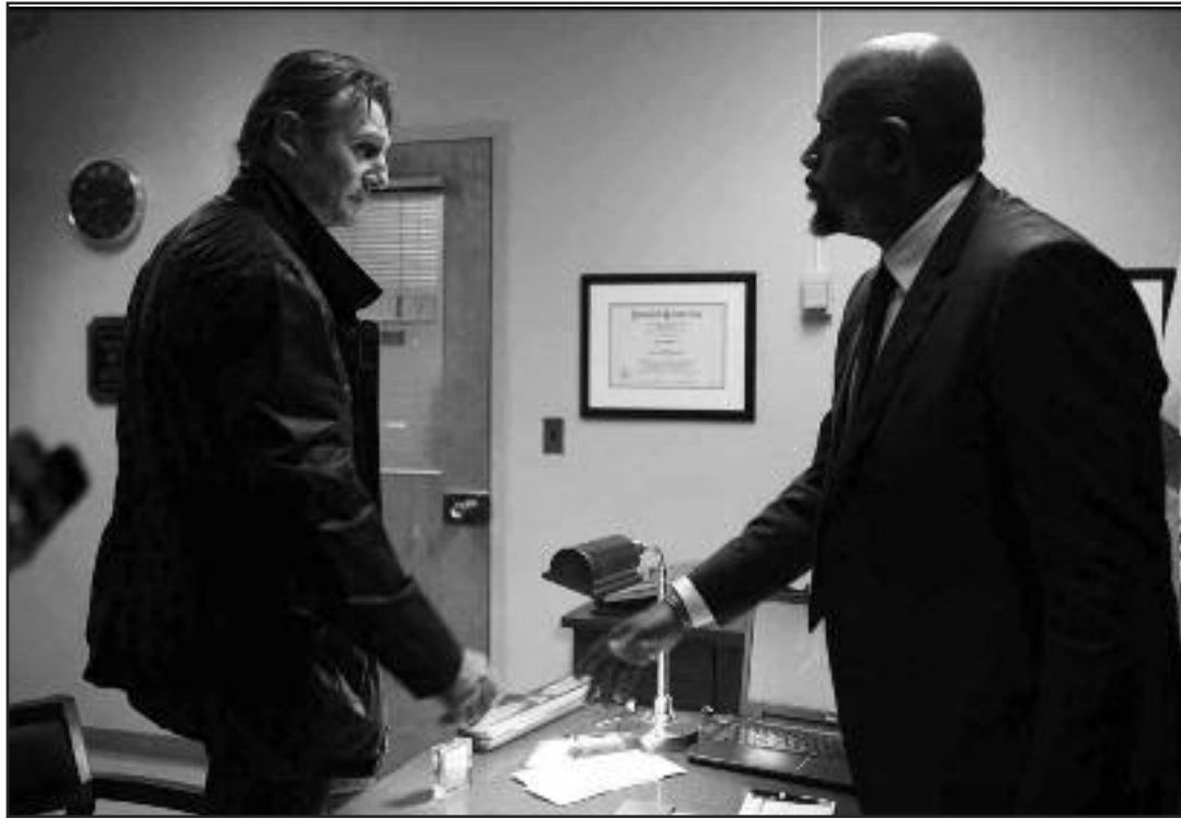
Liam Neeson returns as ex-covert operative Bryan Mills, whose reconciliation with his ex-wife is tragically cut short when she is brutally murdered. Consumed with rage, and framed for the crime, he goes on the run to evade the relentless pursuit of the CIA, FBI and the police. For one last time, Mills must use his "particular set of skills," to track down the real killers, exact his unique brand of justice, and protect the only thing that matters to him now - his daughter.

Forget the foreign adventures of yestermovie. This one's set entirely in Los Angeles, where Liam Neeson's particular-set-of-skills-having ex-government operative Bryan Mills is framed for murder. Yes, MURDER! Instead of rescuing someone, this time he must find the real killer and clear his own name. Presumably he was set up by the associates of one or more of the henchmen he slew in the first two movies, and there are indeed a number of lumpy-faced