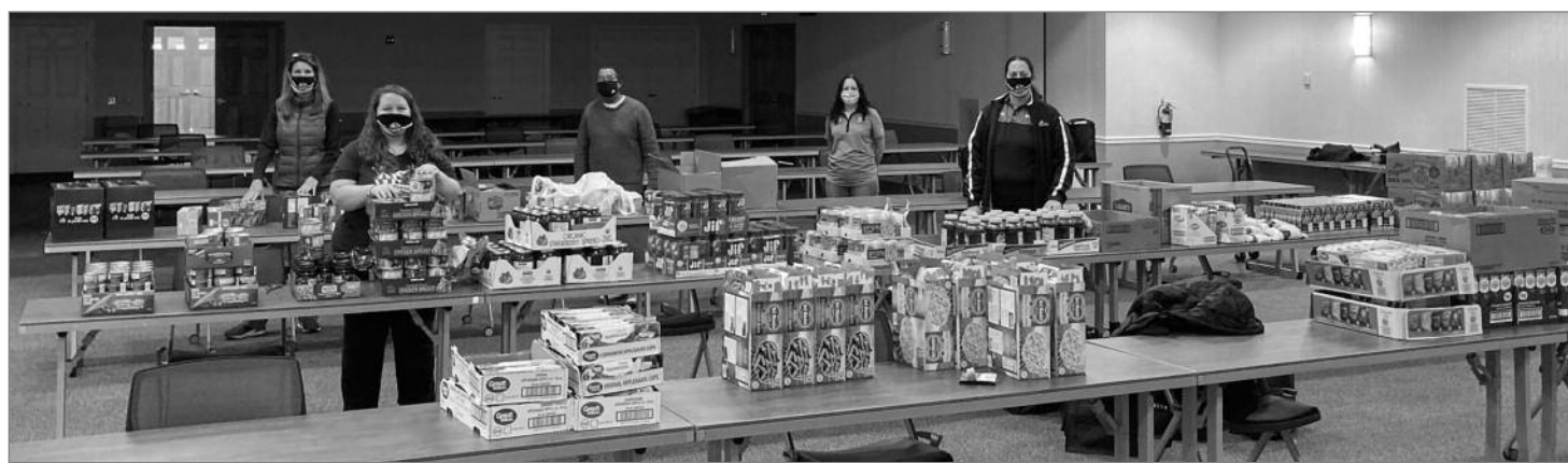
Members of the CSM Student Life team prepare bags of food for distribution to CSM students at the Leonardtown Campus.

You may also be interested in reading: https://news.csm.edu/all-news/student-life-team-distributes-800-pounds-of-food-to-csm-students-during-fourth-mobile-hawk-feeder-event/ .