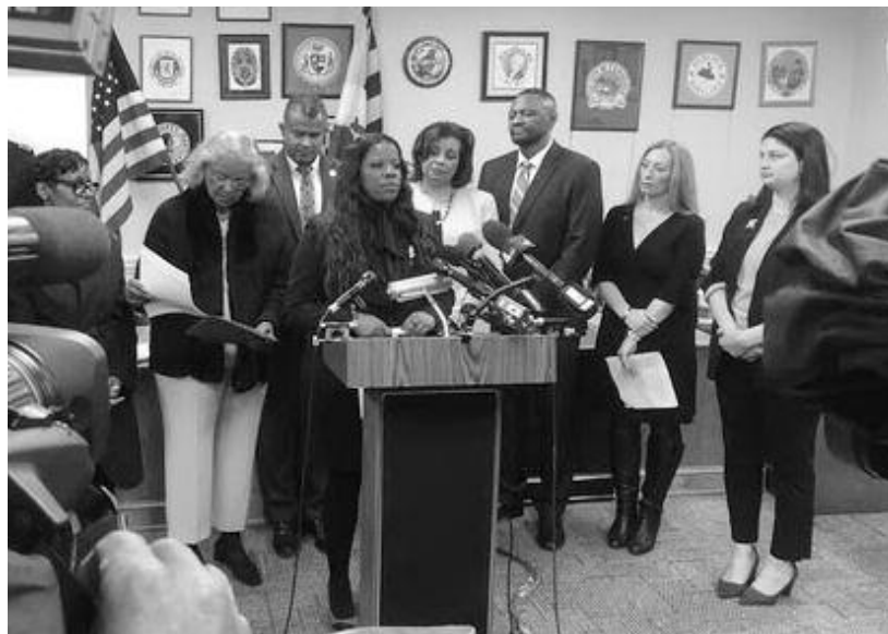
Prince George's County State's Attorney Aisha Braveboy at a press conference Feb. 11 to discuss House Bill 917 (HB917) and Senate Bill 606 (SB606), "Criminal Law – Hate Crimes Basis – 2nd Lieutenant Richard Collins, III's Law."

"Requiring prosecutors to prove that hate or bias is the only motive for a crime is an extremely high standard that