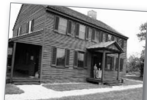
Surratt House Museum