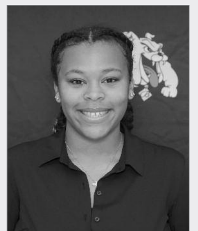
PHOTOGRAPH COURTESY BOWIE STATE SPORTS INFORMATION

—Gregory C. Goings, Bowie State Sports Information