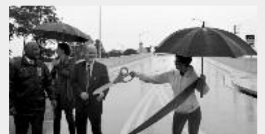
Despite the rain Friday, there was a good turn out for the ribbon-cutting ceremony for the long-awaited bridge opening at Riverdale Park Station.