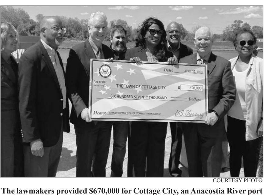
town, to support its efforts to address stormwater drainage issues that impact nearly half the town's families.

"Today marks a momentous occasion for the Town of Bladensburg as we celebrate two significant awards for federally funded appropriations in the Port Towns. This achievement underscores the dedication and hard work of our esteemed United States Senators representing the great state of Maryland. We extend our heartfelt gratitude to Senator Ben Cardin and Senator Chris Van