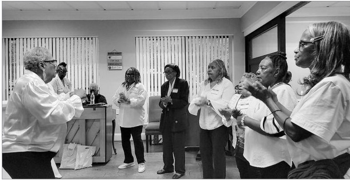
Members of the Largo Landing Choir perform for visitors at Fellowship Square Largo Landing Fellowship House's Open House. Themed "A Home Built on Hope: Strengthening Community Ties," the Oct. 17 event included tours of the unique affordable housing property that is specifically for seniors (age 62+).

Vol. 91, No. 43 October 26 — November 1, 2023 Prince George's County, Maryland Newspaper of Record Phone: 301-627-0900 25 cents