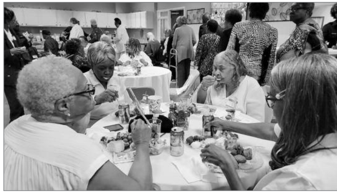
Guests and residents gather and network at Fellowship Square Largo Landing Fellowship House's Oct. 17 Open House.