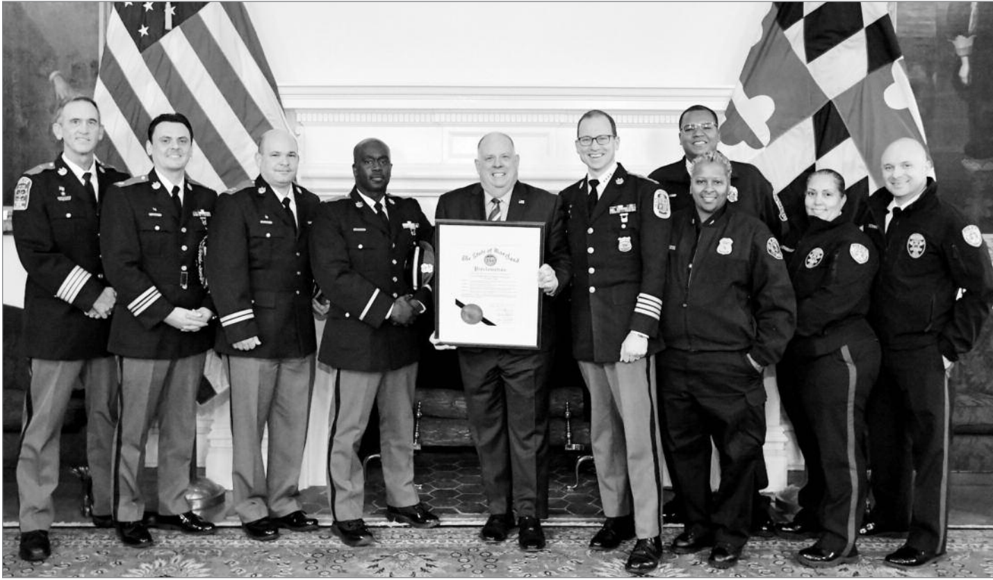
AT MARYLAND STATE HOUSE, 100 STATE CIRCLE, ANNAPOLIS, MD 21401