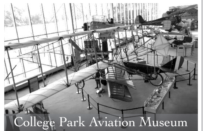
College Park Aviation Museum