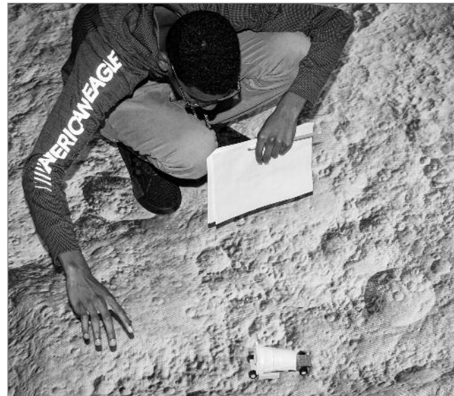
A boy races his moon rover on an image of Moon craters after designing, building and testing it with his team at STEM Boys Night In at the Goddard Visitors Center.